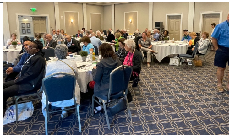
Sarasota Meeting attendees listened to and participated in the day's presentations.