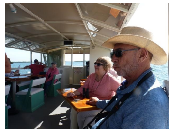
Sarasota Unit retirees enjoyed their Manatee River cruise

The Treasure Coast Unit of RC 43 resumed meetings in October and will continue through May. Joint meetings are scheduled in 2019 with Space Coast sister chapters as well as meals at local culinary programs, boat rides and other events.