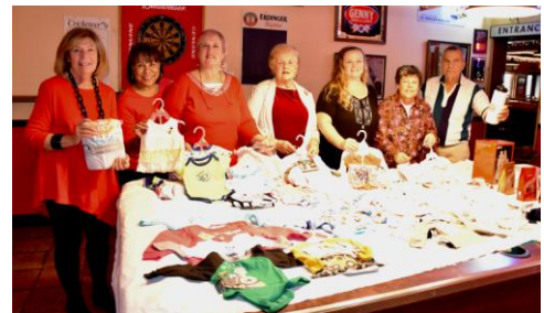
Thank you Treasure Coast TRIF Unit for sharing in our yearly Silent Auction to raise money for the Virginia King Early Education Launch Award!