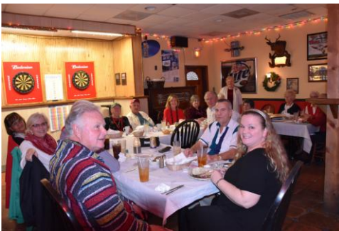
Enjoying our Holiday lunch at Rooney's