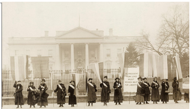
A photo from another protest march 100 years ago: Suffragists picket the White House in 1917.

On March 3, 1913 a women's suffrage march in Washington D.C. was attacked by angry onlookers while police stood by. The march occurred the day before Woodrow Wilson's inauguration. Many of the 5,000 women participating were spat upon and struck in the face as a near riot ensued. Secretary of War Henry Stimson then ordered soldiers from Fort Myer to restore order. Unfortunately, it seems that the more things change the more they stay the same.